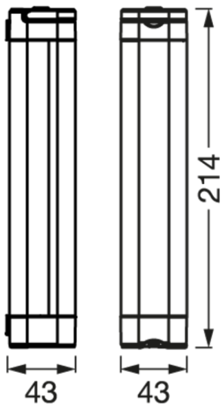
PGLINEAR LED TASK LIGHT 200MM IP54 WTMiPRCmkn