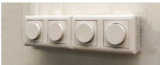
An MCU SELECT DALI-2 component has been installed to dim the trunking system