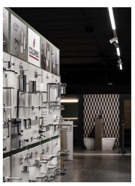
New TRUSYS lighting system at ZANUTTA SPA