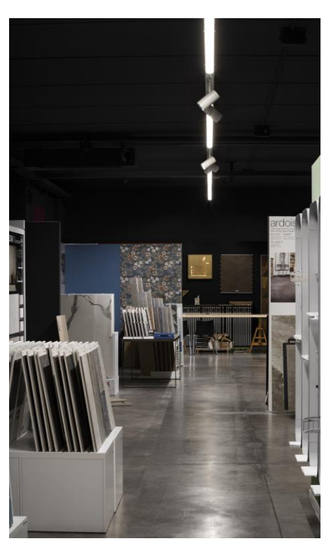
New TRUSYS lighting system at ZANUTTA SPA

LEDVANCE's meticulous attention to the new lighting system at the ZANUTTA SPA store in San Donà di Piave, designed in harmony with the open space layout, aimed to improve the store's aesthetics. The dynamic lighting solution, featuring TRUSYS and TRACKLIGHT SPOT by LEDVANCE, not only highlighted the displayed products but also garnered appreciation from the store, attracting more customers and creating an environment that reflected the quality of materials and products on display.