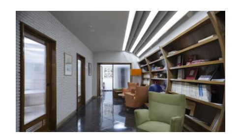
LEDVANCE's PFM LED Strips in the executive lobby

Additionally, the client benefits from significantly improved light quality and reduced maintenance costs.