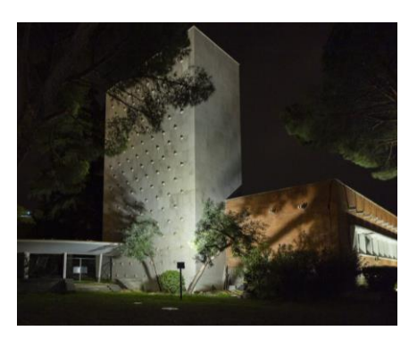
LED projectors from LEDVANCE for the facade